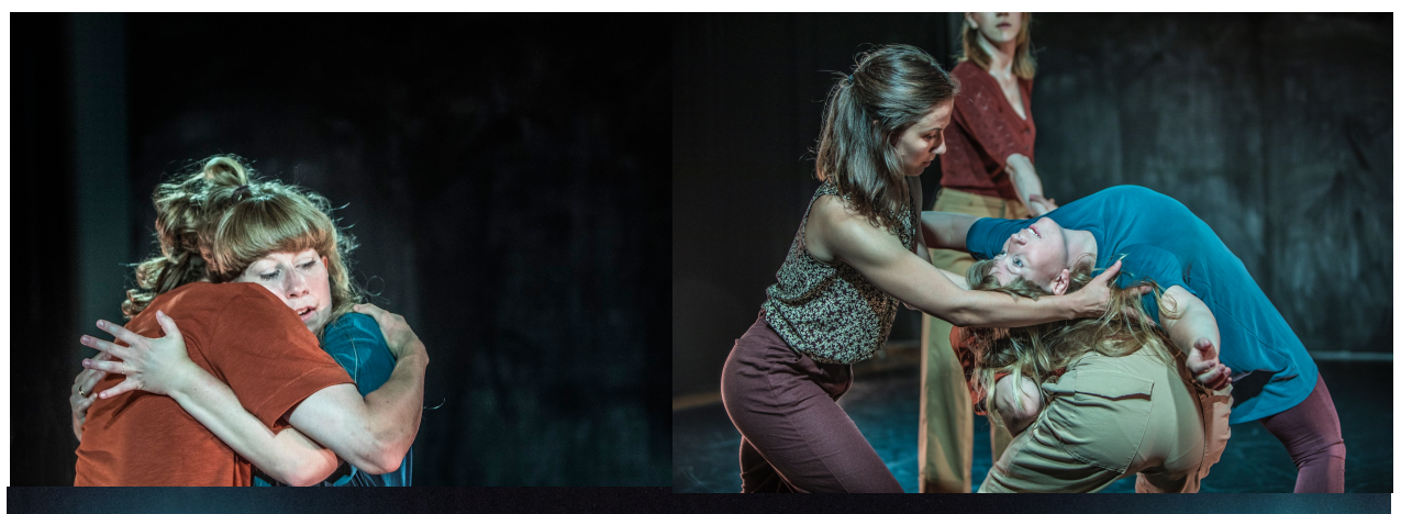
Born to Live - A dance theatre production with high pace and intricate choreography aiming to emotionally move you.